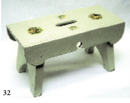
Some of the Sloyd models from the 1902 series used to instruct beginning students. The numbers in the corner of each indicates its place in the progression, from #10 (relatively easy) through #37 (much more challenging).